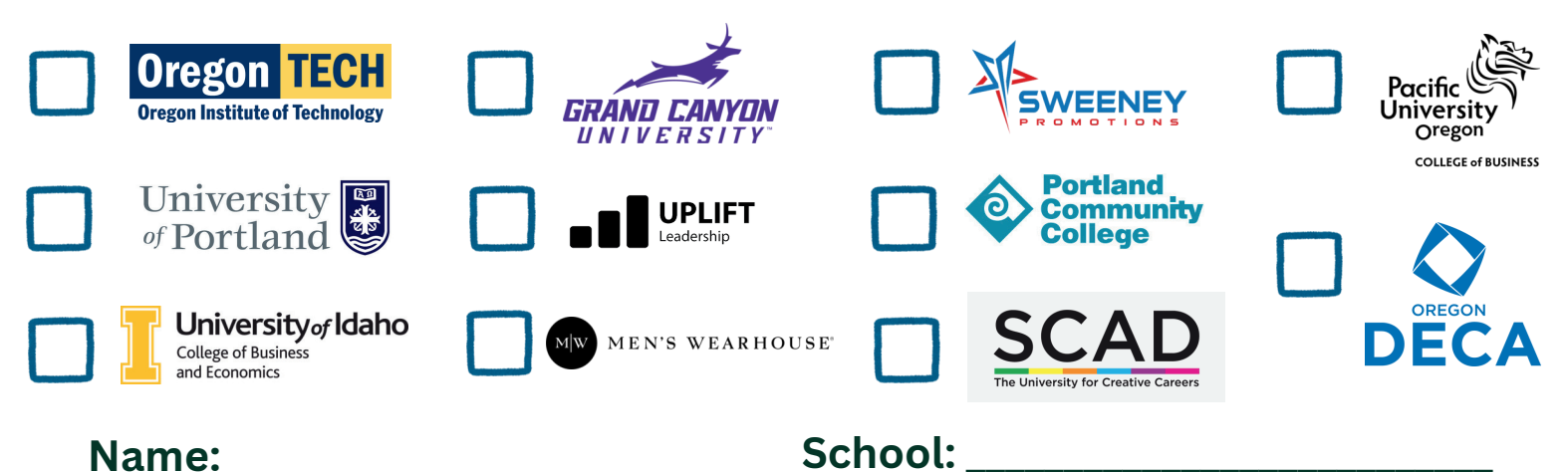
EXHIBIT SHOWCASE - MONDAY

Turn in this completed card to Headquarters (suite 206) by 4:00PM Tuesday for a chance to win prizes. Winners drawing at the Grand Awards Session - Winners get recognized on stage and win a great prize.