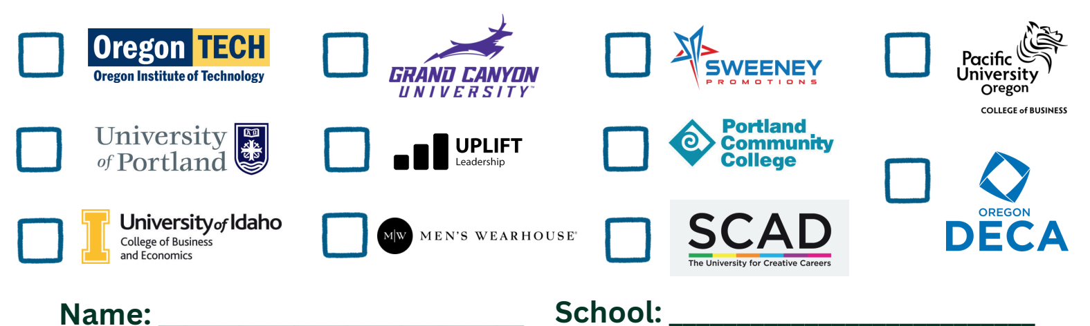
EXHIBIT SHOWCASE - MONDAY

Winners drawing at the Grand Awards Session - Winners get recognized on stage and win a great prize.